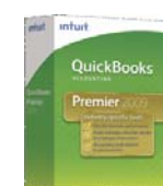
Premier Edition 2009